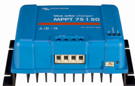
Solar charge controller MPPT 75/50