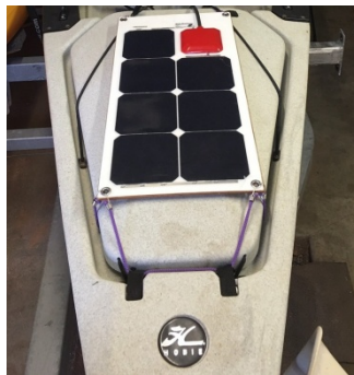
Available in a variety of sizes, shapes & efficiencies