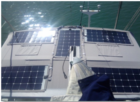
Semi-Flexible & 1/16" thick: perfect for canvas installation