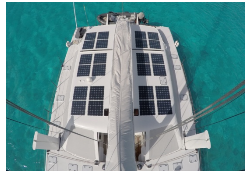
Highest Power, Lightest Weight